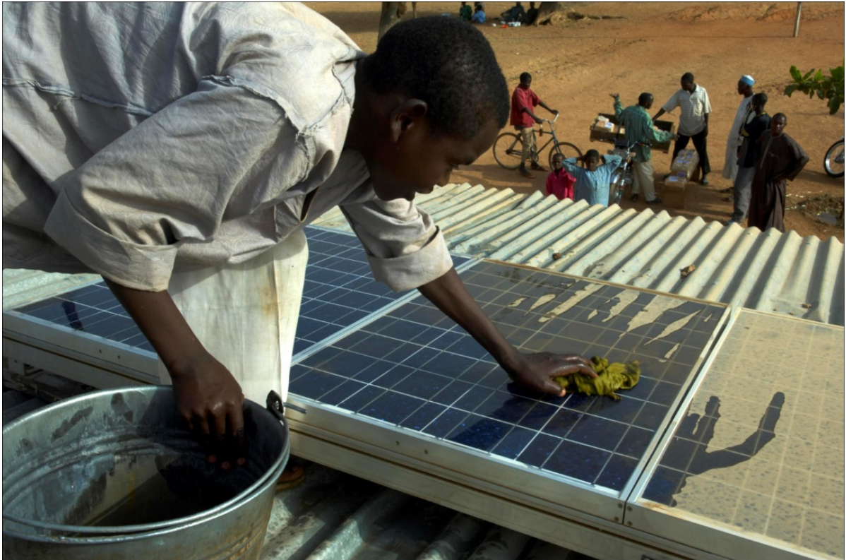
Small scale solar energy project in the village of Wawan Rafi, Jigawa State Northern Nigeria. 2006