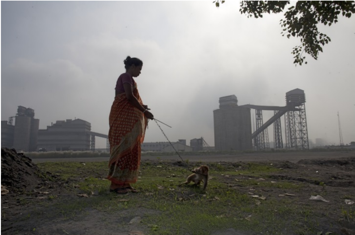
A woman plays with her pet monkey on earth covered with flyash from Kolaghat thermal power station in East Medinipur covers the ground and hangs in the air around a cement factory next to the power plant.