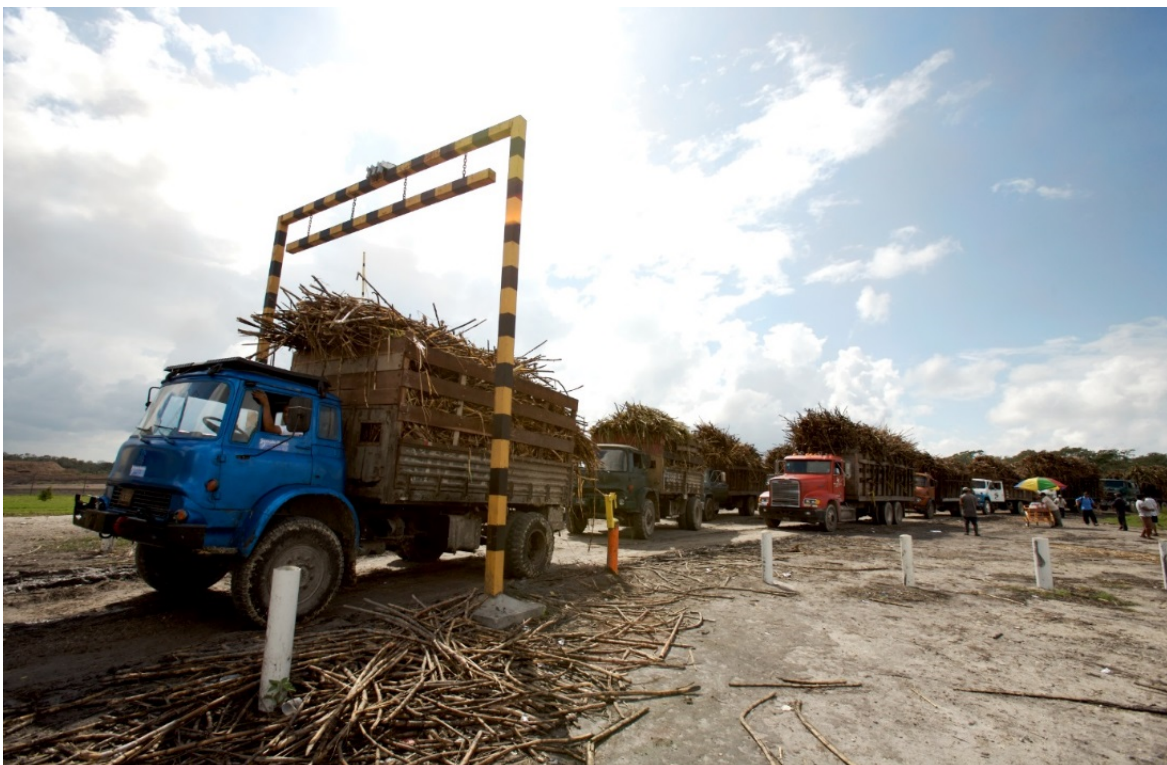
'Trucks delivering raw sugar cane to a mill in Belize. More than a tenth of the country's population relies on sugar cane production for their income.'