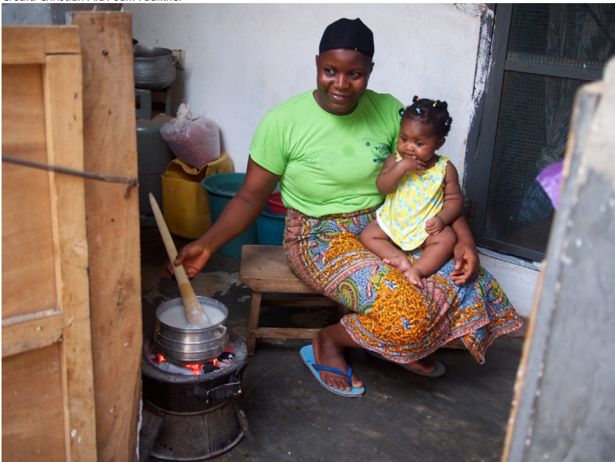
Aviva are partnering with Climatecare to offset unavoidable operational carbon emissions. Nearly 3 billion people in the developing world cook food and heat their homes with traditional cook stoves or open fires. Since 2007 550,000 Gyapa stoves have been sold in Ghana. These cook food more quickly, require 50-60% less fuel and are less smoky.