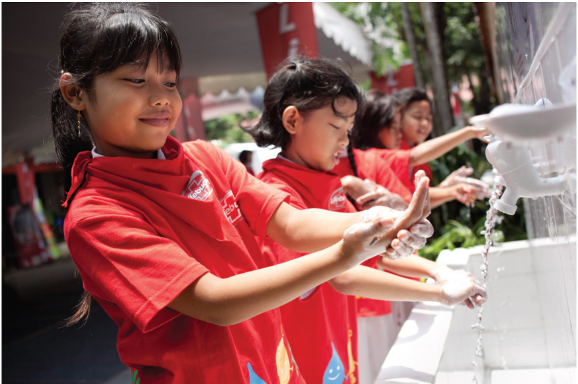
Lifebuoy's School of Five Handwashing programme, Global Handwashing Day, Indonesia.