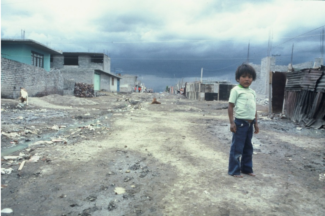
Lone child in a Mexico City slum, Mexico